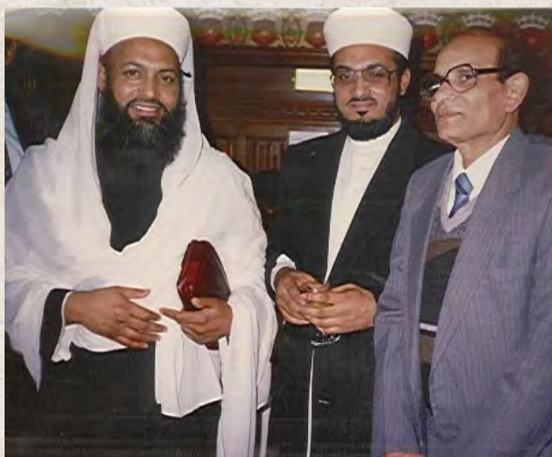
His Eminence pictured in the Houses of Parliament in the 1980s, where he offered advice on faith matters.