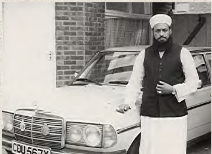
His Eminence settled in Coventry, UK after a short stay in Blackburn.