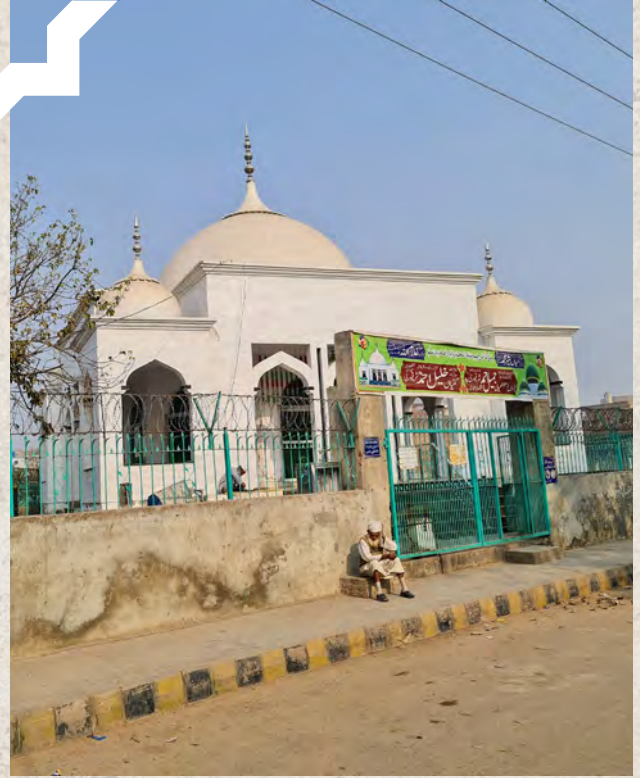
Mausoleum of Murshid Sher Rabbani Muhammad (RA) in Sharqpur, Pakistan.