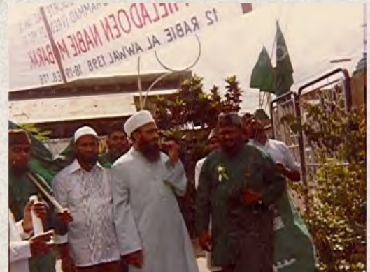
Suriname – celebrating the Mawlid (birth of Holy Prophet Muhammad ﷺ).