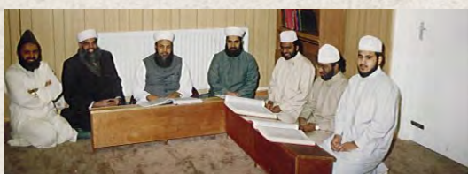
His Eminence is pictured teaching young pupils enrolled at Jamia Islamia, a boarding school in Coventry where he taught the Natural and Revealed Sciences.

This vision came to fruition initially with the establishment of Jamia Islamia Islamic Studies Centre in Coventry in 1982. The graduates of this programme went on to become illustrious Islamic Scholars from different corners of the world, and the organisation went on to acquire the grounds of Hijaz College, a 64 acre estate, in 1993.