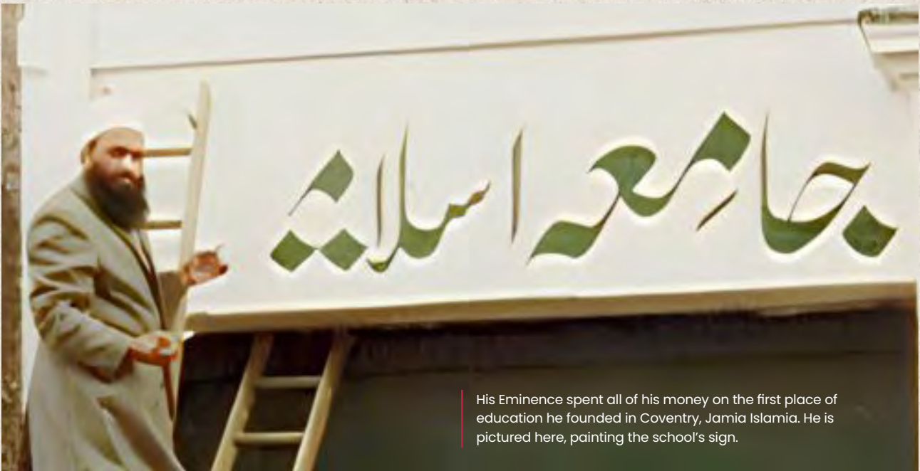
His Eminence spent all of his money on the first place of education he founded in Coventry, Jamia Islamia. He is pictured here, painting the school's sign.

He migrated not for economic reasons, like most migrants who moved during the 1960s, 70s and 80s. He made this decision because he believed this was the best place to instil strong values in his children. As they grew up in Coventry, he encouraged them to integrate their spiritual and worldly lives, pursuing careers in natural sciences while maintaining their religious beliefs. His Eminence assured his family that he wanted to bring the principles of Islam to the West.