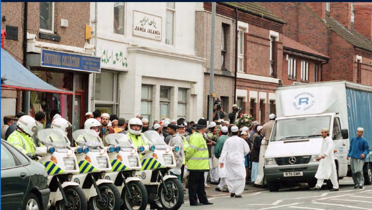
The blessed reinterment procession, escorted by a convoy of authorities, dignitaries, religious leaders and the thousands that loved him.