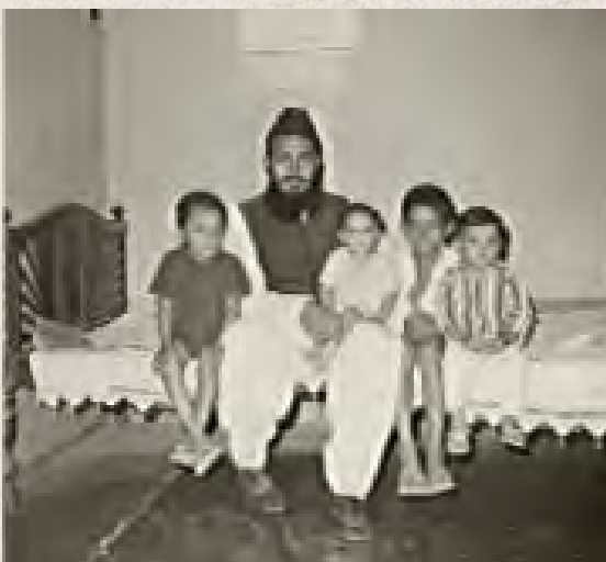
His Eminence is pictured here with his young family, in his family home in Pakistan before their migration to UK.

When his mother questioned his decision to move his family from Pakistan to England, worried about the un-Islamic nature of a foreign country. His Eminence, coming from a respected and meritocratic family, reassured her that his aim was to foster true Islamic values in England. He cited the poet Allama Iqbal who said, 'When I travelled the East I saw Muslims, when I travelled the West I saw Islamic values.'