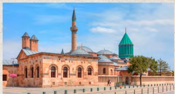
The Mausoleum of Murshid Jalal ad-Din Muhammad Rumi (RA) in Konya, Turkey. Born in the 12th century. A philosopher and poet, with his poetry gaining broader readership in recent years, attracting a wide global audience to his burial grounds.