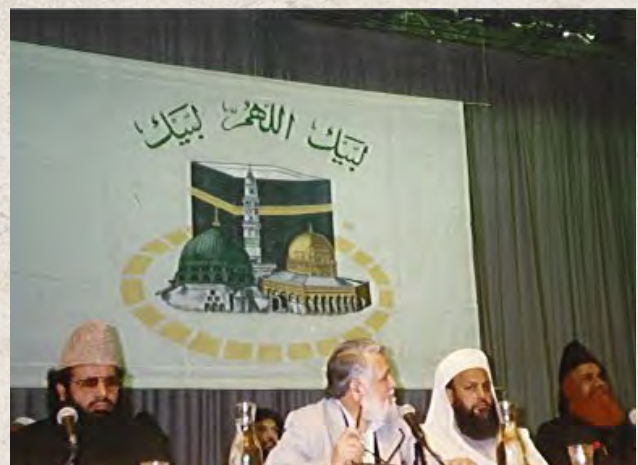
Pictured at the Hajj Convention with Dr Kalim Siddiqui, Director of the Muslim Institute, whom His Eminence advised.