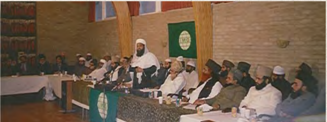
His Eminence leads on the Muslims' robust response to Salman Rushdie's controversial and offensive book, the Satanic Verses.