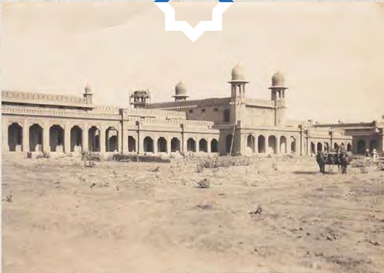
1900s Lyallpur University campus (now University of Agriculture, Faisalabad) where His Eminence studied English, Urdu, Persian and Arabic.