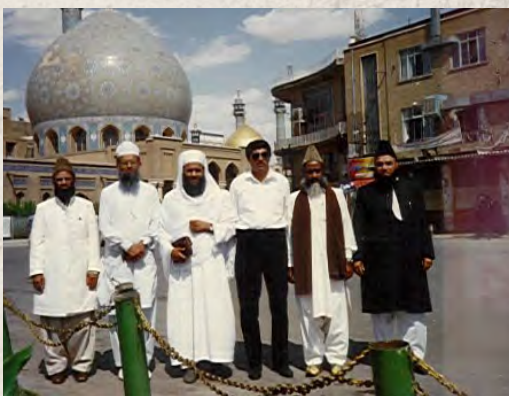
Pictured on his several trips to Iran during his efforts at promoting peace among Muslim nations.

With the aim of peace-making and reducing tensions during the Iran and Iraq conflict, His Eminence visited Iran multiple times, engaging in extensive dialogues with President Rafsanjani, Supreme Leader Ayatollah Khomeini, Ayatollah Syed Ali Khamenei, and Minister of Cultural Affairs Hujjatul Islam Dr Khatami. These meetings drew on Iran's Islamic Revolution experiences and discussed the current state of the Muslim Ummah. His Eminence advocated for greater unity and coordinated action among Muslims. These leadership qualities contributed to the Muslim International Organisation becoming a powerful force in reshaping global Muslim affairs.