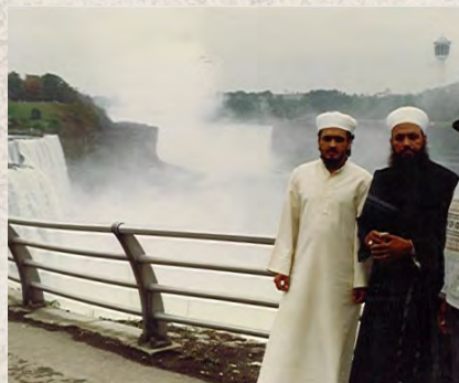
Canada – His Eminence travelling with his eldest son (right).