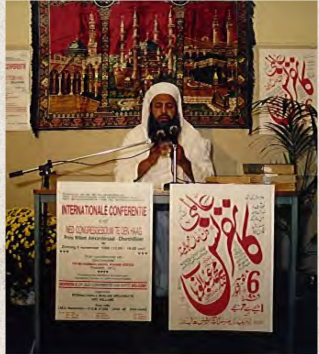
His Eminence promoted universal Islamic values across all continents, serving humanity regardless of their background.