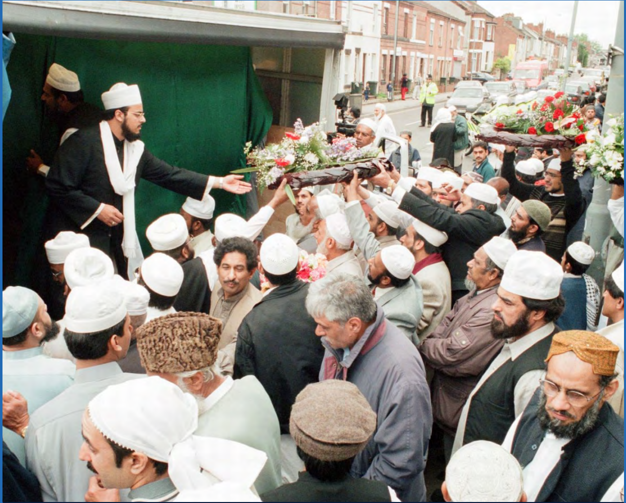
Thousands paid their respects with gifts of flowers for the reinterment of the noble Saint.