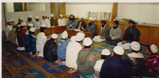
The senior students at Jamia Islamia gained great insight and philosophy from the esteemed scholar.