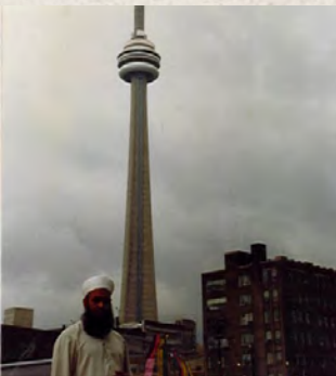
Sydney, Canada – His Eminence led a large Muslim community in Canada.

Under his leadership, the World Islamic Mission organised the Hijaz conference in London, where global scholars discussed the liberation of the Hijaz region in Arabia from non-Islamic rule. His Eminence articulated clear demands to relevant governments, leading to ministers from those countries negotiating terms in the UK. While he refused to compromise on principles, he was open to strategic discussions. However, after the agenda was taken over by others within the organisation, the noble Saint stepped down from this role, citing his inability to participate in negotiations contrary to his principles.