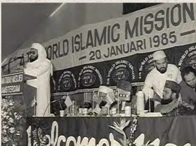
His Eminence spoke at many conferences held by World Islamic Mission.