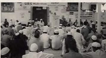
His Eminence continued the tradition of the annual commemoration of Urs (the reunion with Allah Almighty) of his late father in UK.