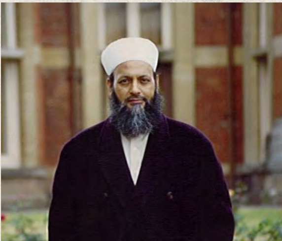
His Eminence lived to acquire the grounds of Hijaz and looked forward to the newly founded Hijaz College being a beacon of teaching Islam in the west.