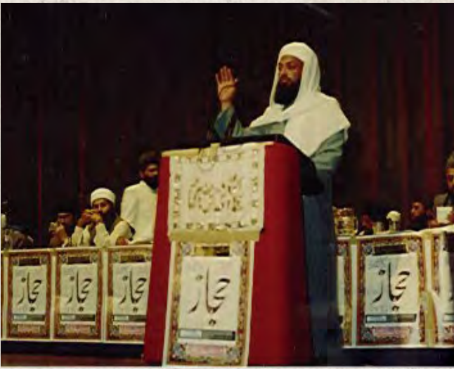
His Eminence campaigned nationally to secure donations to help establish Hijaz College, the large country estate, to fulfil his vision.