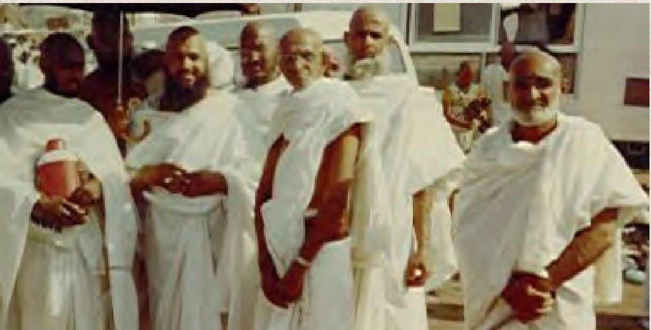
His Eminence is pictured in his Ihram (Simple ceremonial clothing for pilgrimage) as he carries out Hajj in Makkah Shareef. He often encouraged Mureeds (Students of spirituality) to join him on pilgrimage to increase the blessings and reward.