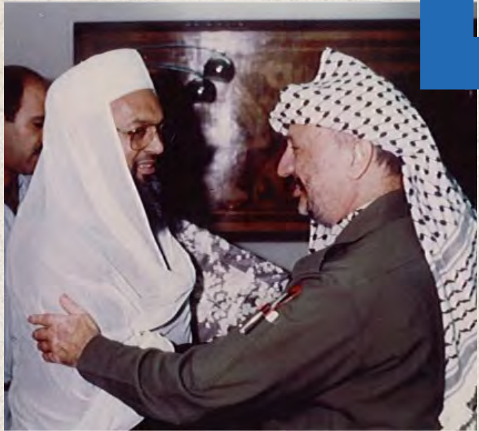
In Tunisia, His Eminence met with Yasser Arafat in 1990 to discuss the future state of the Palestinian State.

In 1990, His Eminence was invited by Yasser Arafat of the Palestinian Liberation, to Tunisia to discuss the future of the Palestinian state. In this meeting, His Eminence made it clear that these discussions were taking place on the basis that no national issues should overtake Islamic issues, as those Islamic issues were the fundamental basis upon which the Muslim Ummah must engage with in their support of the Palestinian cause.