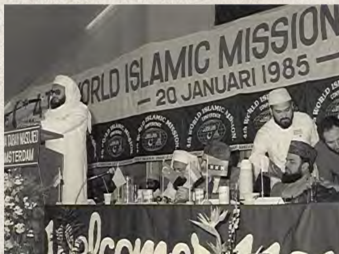
His Eminence organised and attended hundreds of meetings internationally to spread the message and values of Islam.

When the noble Saint came to England, he settled in a town called Blackburn and stayed there for one year. During the course of that stay, he had occasion to meet many non-Muslims for the purposes of inter-religious dialogue. In 1970s Britain, it was not common for people of different faiths to meet each other or come together. His Eminence often met with Christian clergymen, including the bishop of Blackburn. He also encouraged Muslims in Europe to contribute actively and help shape the communities where they had chosen to migrate and settle.