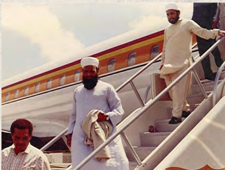
South Africa – touching down, his guidance reached several continents..