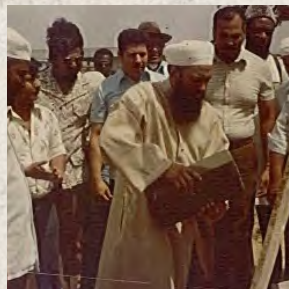
Brick-laying the foundations of a centre for Islamic education South America.