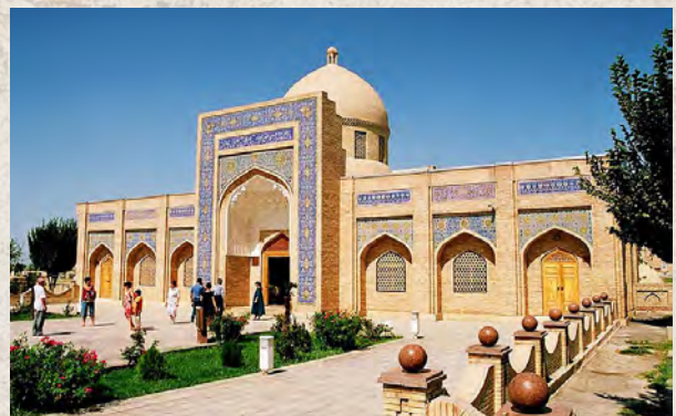
The Mausoleum of Murshid Baha Al Deen Naqshband (RA) in Bukhara, Uzbekistan. He lived in the late 1300s and revived Islamic thought in Central Asia.