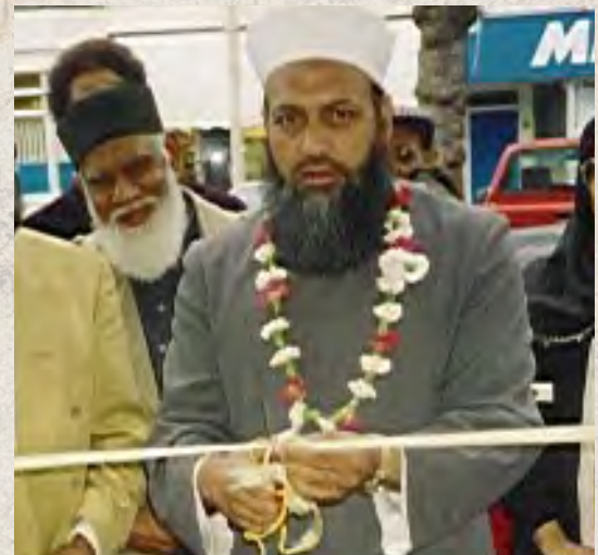
His Eminence is pictured cutting the ribbon at the opening of Jamia, the institution he ran from the ground up.

He migrated not for economic reasons, like most migrants who moved during the 1960s, 70s and 80s. He made this decision because he believed this was the best place to instil strong values in his children. As they grew up in Coventry, he encouraged them to integrate their spiritual and worldly lives, pursuing careers in natural sciences while maintaining their religious beliefs. His Eminence assured his family that he wanted to bring the principles of Islam to the West.